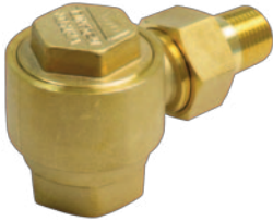
RPI Part #CST059 OEM Part #61301602492