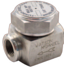
RPI Part #CST082 OEM Part #68722

Models: 100 Series, 200 Series, 3522, 3523, 3525, 3533, 3622, 3633, 400 Series, 500 Series, 700 Series, 800-42" & 800-76"