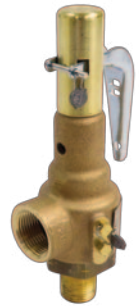
RPI Part #CSV084 OEM Part #61301608100

Models: 400 Series, 4200MPS, 500 Series & 700 Series