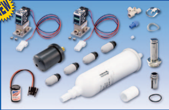
PM PACK (GENERAL)