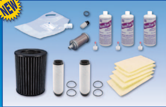
PM PACK (VACUUM)