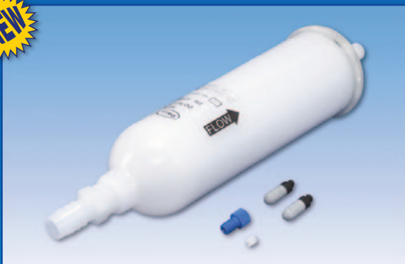
PM PACK (GENERAL)